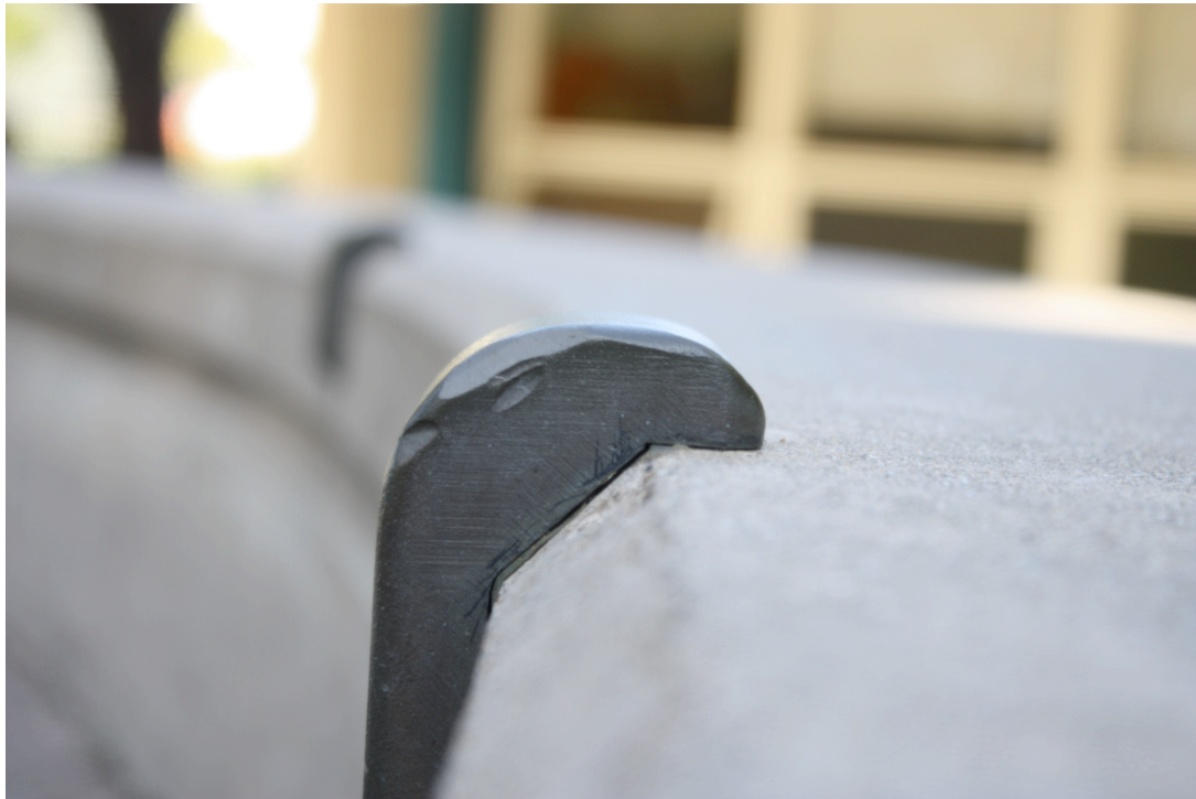
Frederick Khalil, 2011