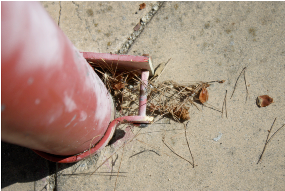
Frederick Khalil, 2011