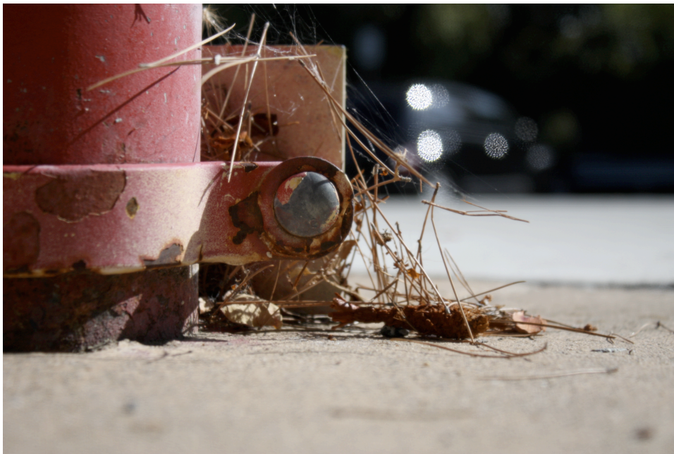
Frederick Khalil, 2011