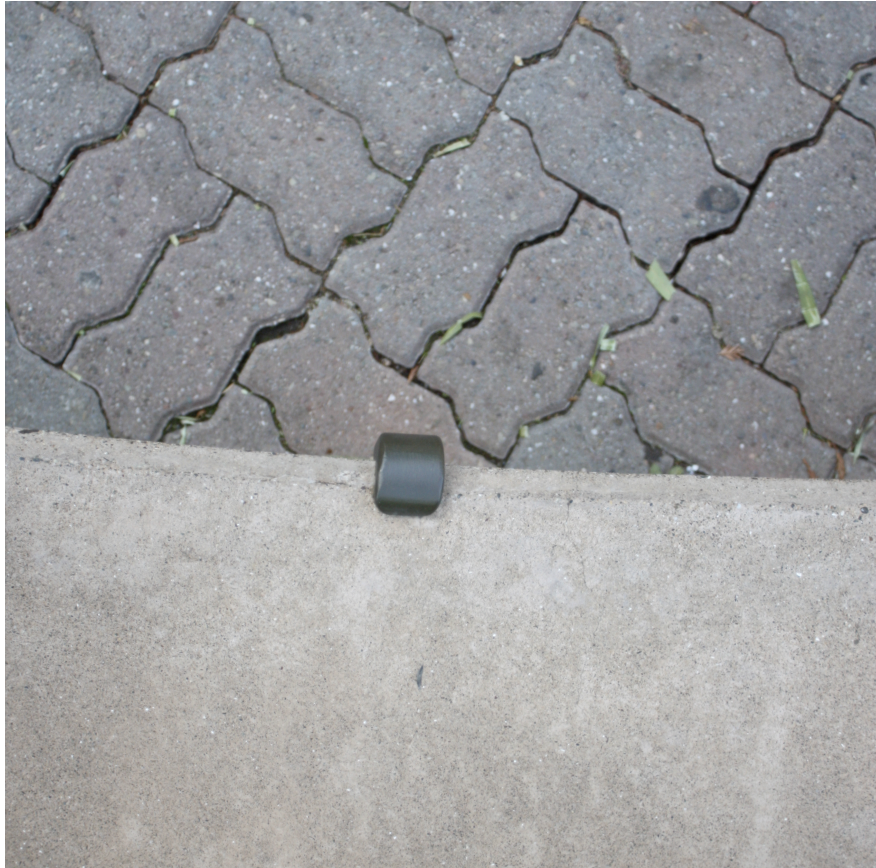
Frederick Khalil, 2011